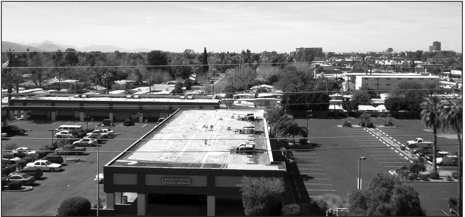
If you were to buy one of the new apartments, at the top, on the west side, of the new Grigio Metro that is being built on the southeast corner of Apache and McClintock this would be your view of Hudson Manor, which is just beyond the commercial strip mall and the Modernette trailer park. You can see Hudson St. right in the middle of the photo.