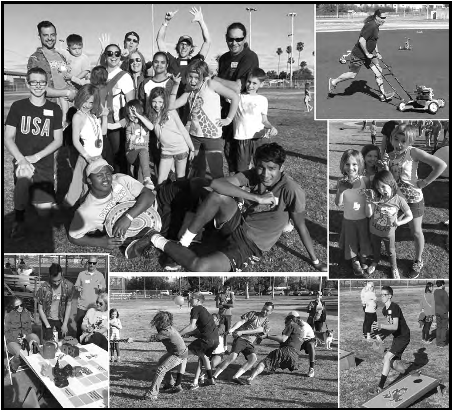
Hudson Manor was well represented at the 5th Annual Neighborhood Olympics held the last weekend in February. This inaugural group of athletes went all out at Daley Park. The highlight was the girl's relay team taking 2nd place! Congratulations all!